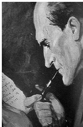
After a Holiday break, the Study Group resumed monthly meetings in January.

"The Resident Patient" appeared in "The Memoirs of Sherlock Holmes," in 1892. Some versions of this story begin with a sequence from "Cardboard Box," in which Holmes demonstrates that he can read Dr. Watson's mind. Conan Doyle's publishers apparently felt that this famous "mind reading" sequence was so exceptional that it needed to be shared with readers. As we recalled, Conan Doyle originally blocked publication of "Cardboard Box" because of the subject material.