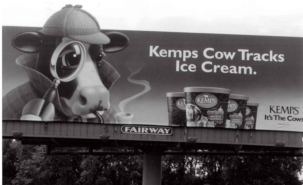
Our members from outside the Twin Cities may be interested to see this photo of a billboard that has been in rotation alongside major highways in the metro area.

The Annual Dinner will be held the first Thursday of December, so mark Dec. 2 on your calendar.