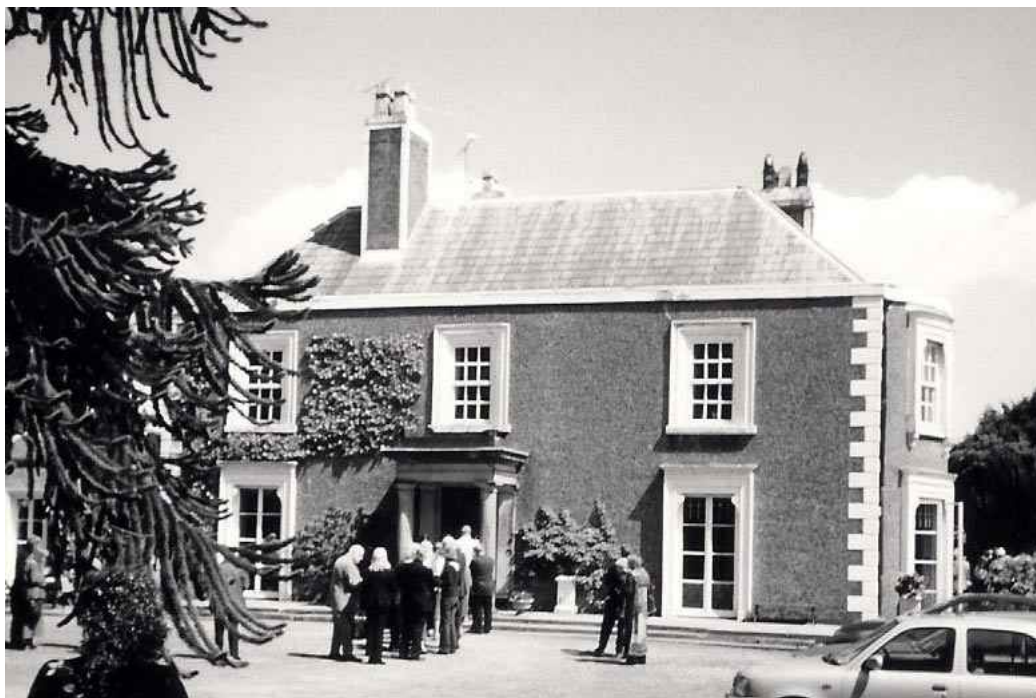
Mourners at Poulton Hall